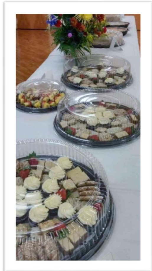
Takeaway Catering Setup

Chocolate Mousse Cups - $20 per dozen, 2 dozen minimum