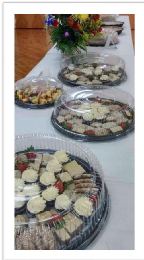
Takeaway Catering Setup

Chocolate Mousse Cups - $20 per dozen, 2 dozen minimum